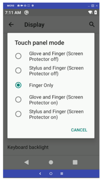
Default setting is "Finger only" mode

Example for MC93ex-NI with Android 10 and Build number 10-16-10.00-QG-U00-STD-HEL-04